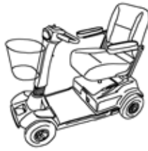
Admiral GPS & STD Seat Stocked